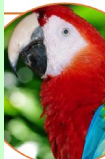
A Scarlett Macaw