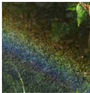
UKS2 Runner up