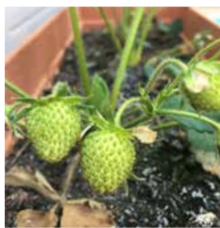
LKS2 Runner up