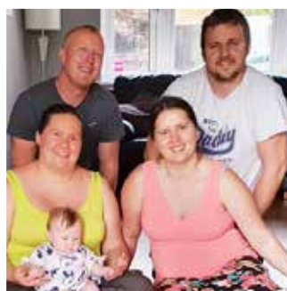
EYFS Runner up