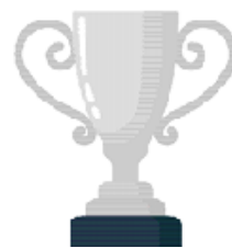
Cherry, Oak & Sycamore 98%