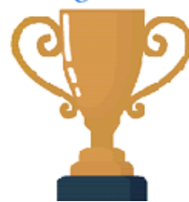
Ash 97.9 %

The winning class(es) will receive an additional playtime this week as a reward. Well done to PearClass who had 98.7% attendance!